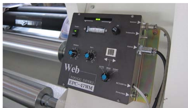
Controller Series 47 is installed on Rewinding Machine